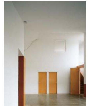
Private House, Fishtoff, Ground floor